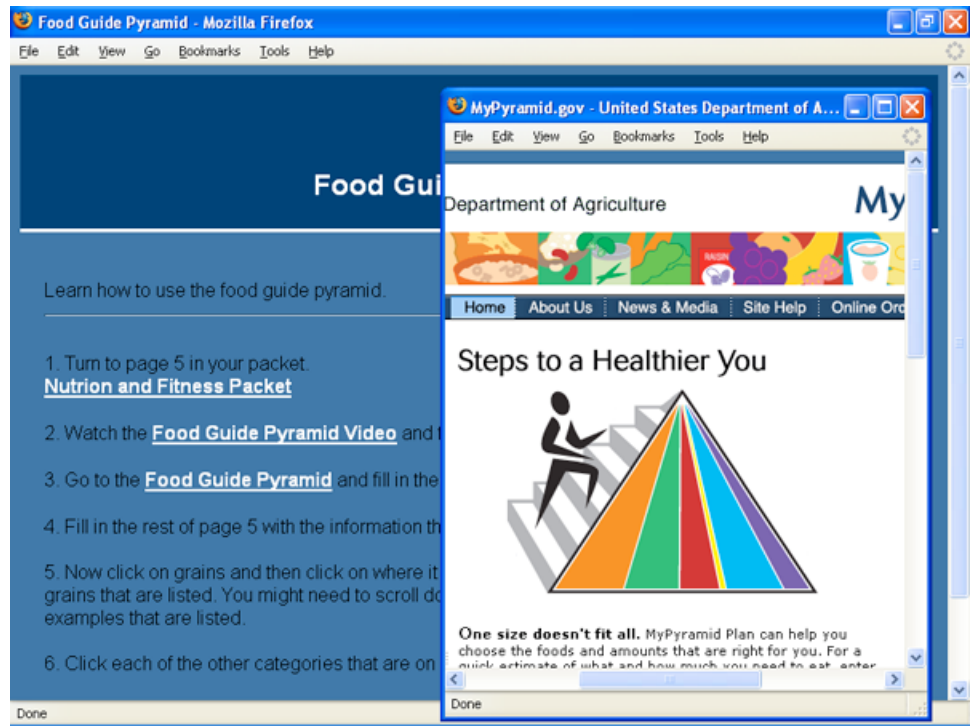
Figure 1: Screenshot of an IA project page aimed for middle-school students

We begin the description of the Instructional Architect with two examples created by teachers using our tool (see Figures 1 and 2). The foreground of each figure shows one of the teacher's selected online resources. The background shows the output of using IA: a web page containing the content created by the teacher, consisting of activities and annotations for online resources (referred to by links). Note how the level of detail in the projects varies; the project in Figure 1, intended for middle-school students, provides detailed activities for the students, whereas the project in Figure 2 (intended for kindergarten students) seems to be more of a lesson plan sketch.